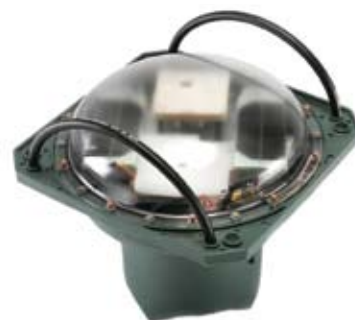
M3I Sonar Buoy

The SeaStar Team is pleased to introduce the new M3I Sonar Buoy model. The M3I buoy transmits satellite position and echo sounder readings that can help to determine fish under the buoy. It includes a satellite transceiver, GPS, a 50 KHz/500W echo-sounder, sea surface temperature sensor and magnetic On/Off switch.